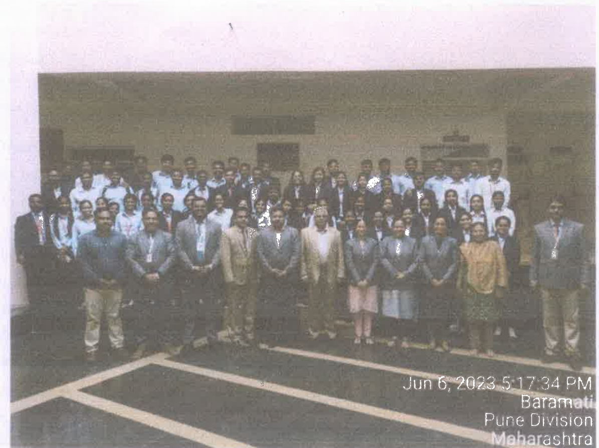
AIMS Team with Student Participants

Poster Designing Inter-Class Skills Competition 2023 Day & Date – Tuesday 06/06/2023